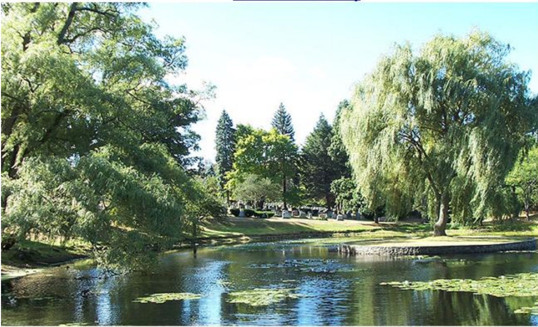
Photo of Forestdale Cemetery